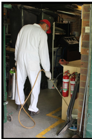
Sandgate Pest Control Technician spraying inside for fleas.

Fleas will be seen when an area is newly disturbed – such as when people get up in the morning or go outside. When the treatment is working, fleas will hatch, contact the treated surface (carpet, soil – treated by Sandgate Pest Control, or pet – treated with on-animal product) and die within a few hours.