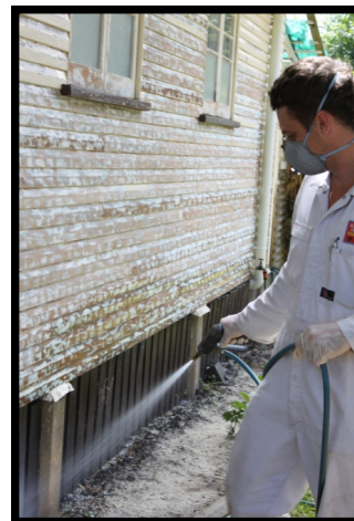
Sandgate Pest Control Technician spraying outside for fleas.